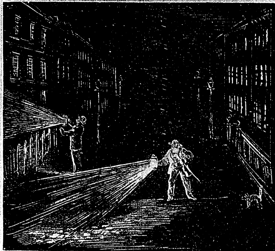
MONTREAL BY GAS-LIGHT.