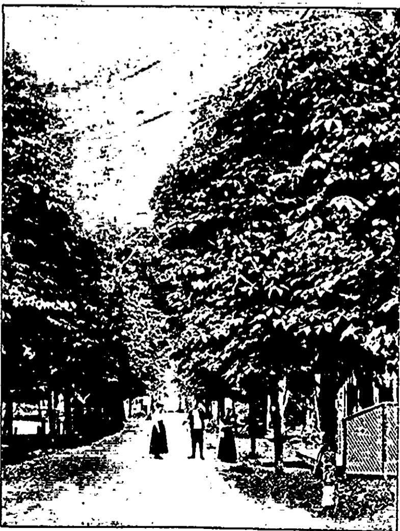
GRIMSBY PARK - AN AVENUE LEADING TO THE LAKE.