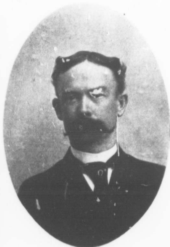
HON. MILES B. McSWENEY, Governor of South Carolina.