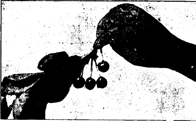
FIG. 814.—WRAGG CHERRY.

cherries above mentioned, besides it is a profitable fruit to grow for market. One difficulty attends it wherever grown, and that is its susceptibility to black knot.