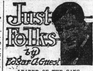
LEADER OF THE GANG.

Feels as young as ever PEOPLE who are able to talk like this can't possibly have impure blood—they just feel fit—no headaches, dyspepsia or bilious disorders. These diseases can be cured by Dr. Wilson's Herbine Bitters A true blood purifier containing the active principles of Dandelion, Mandaraka, Burdock and other medicinal herbs. Sold at your store in a bottle. Family size, five times as large. THE BRATLEY DRUG CO., Limited, ST. JOHN, N. B. Dr. Wilson's Dandelion Bitters, in candy form, also available. For sale by all Druggists and First-class Grocers.