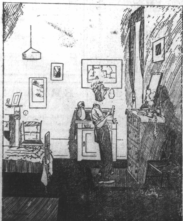
THE UN-SAFETY RAZOR