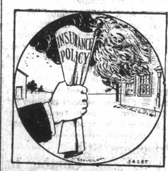
DEFIANCE TO FIRE

This may be exemplified by taking the Russian crop of flax as an illustration. For some years Russia has countries. This industry had begun the prosperity and spirit of the pop to decline owing to the exorbitant ulation.' profits made by the middlemen engagin the governments, and okrug in the capable. Some profound, elemental, ed in the sale and handling of the provinces. At the head of each gov- incomprehensible power intervened; crop, and to foreign competition. It praised at this juncture; it is not a ernment is a governor-general, the and just at the momen that the Teu- is thought that the stoppage of ex-