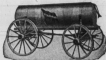
Western Standard Wagon Tank