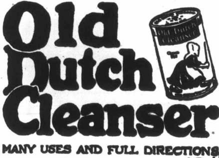
on large sifter-can -10 C