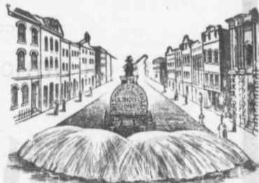
Studebaker Sprinkler (PATENT IMPROVED.)

Does not clog or get out of order. Greatest width of spray Can be graded from driver's seat to any volume.