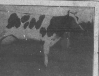
A sample daughter of King Pontiac Artis Canada Pietje Korndyke Queen 2nd, whose record at 26 mos. is 23.17 lbs.

A FEW OF THE OFFERINGS: 30 daughters of King Pontiac Artis Canada, all with official records or with record dams and grand-dams. One with 21.65 lbs. as Jr. two-year-old and with a 23-lb. dam. Three full sisters from a 23-lb. dam—one after has 20.20 at 25 mos. A fine two-year-old daughter of a 23.90 four-year-old daughter of Countess Segis, a 31.70 daughter of King Segis—a rare opportunity. A beautiful daughter of Pietje Korndyke Queen, 26.70, sold at our last sale for $670. She has a full sister with 23.37 as a two-year-old, and is bred to "Champion." Many others with records up to 20 lbs. and having dams and grand-dams to 25 and 28 lbs.