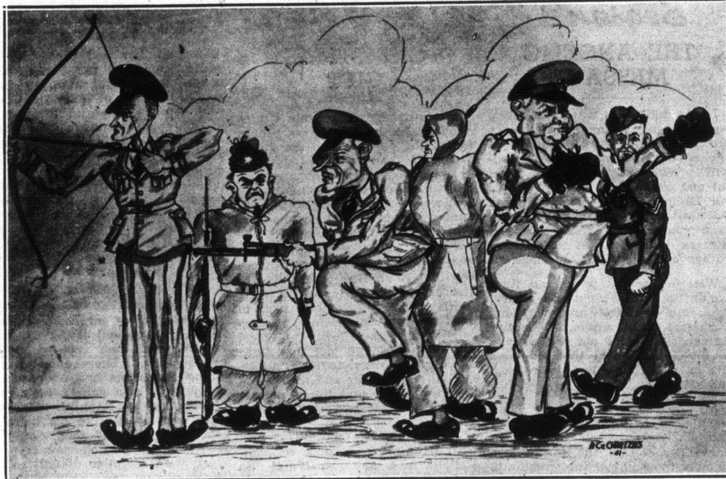
A HAPPY NEW YEAR—SECURITY GUARD