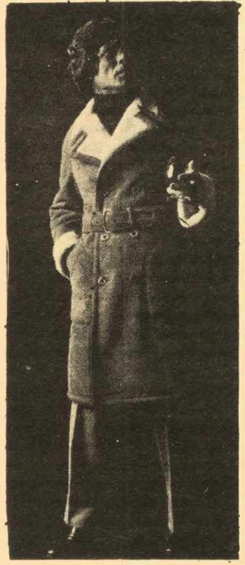
Colwell Brothers Ltd.

Just arrived New Sheepskins New Leathers