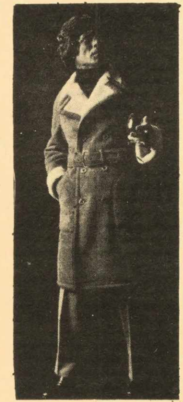
Colwell Brothers Ltd.