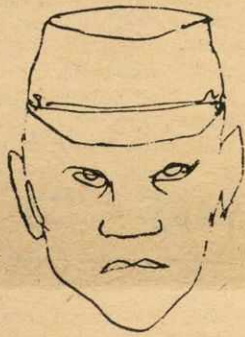
HE GOT SHOT.