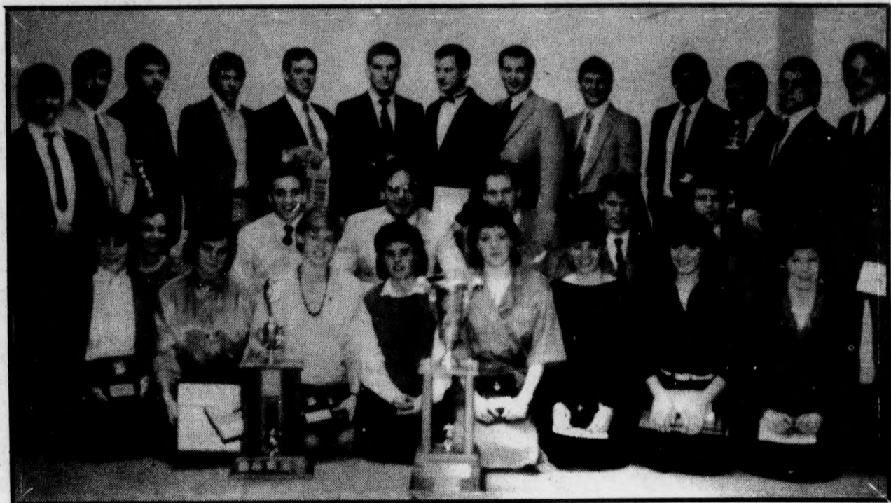
UNB's best athletes are shown here assembled after winning awards at the Annual Athletic Banquet. Shown here are team award winners, coaches of the year, athletes of the year and CIAU all-Canadians.

The rest of the winners are included below.