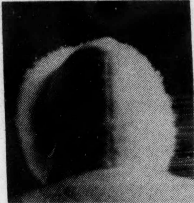
The Unknown Winner I'm going on a year's vacation.