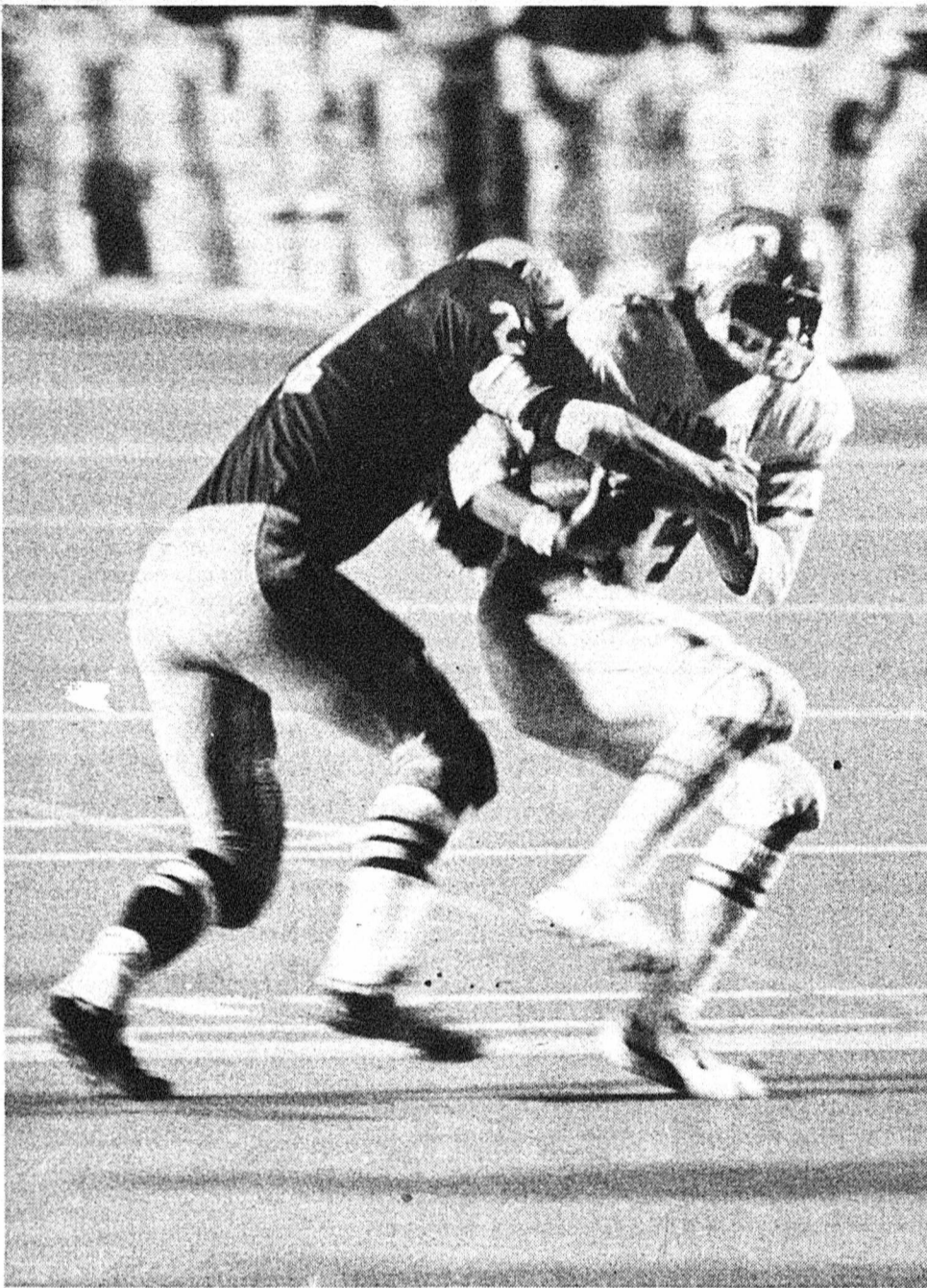
Bears and Dinos grappled for ball Wed. night in Calgary The Golden Bears tussled with U of C and lost, keeping their poor season record to only one win in four games. But they have a chance at revenge Sat. afternoon when the Dinosaurus will be in town for a re-match, 2 p.m. in Varsity Stadium.