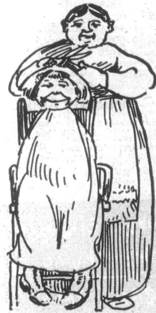
SUPERFLUOUS HAIR REMOVED.

"That's true, too," drawled Richard, "but God ain't pushin' me."