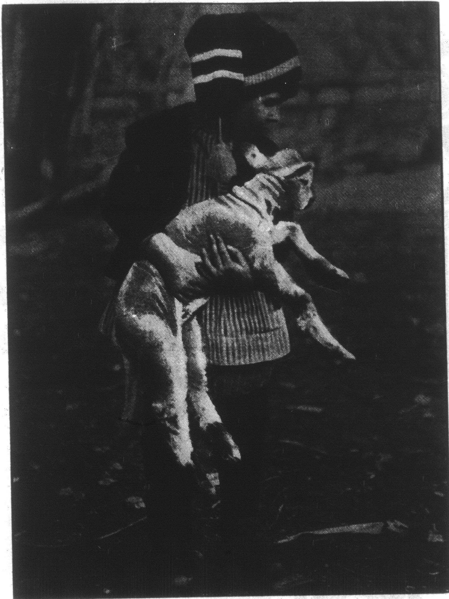
SPRING IS HERE.

With tears in his eyes, and raining down his cheeks, Jamie answered, "It's st. machache, and it's so far down you can't see it."—Woman's Home Com-