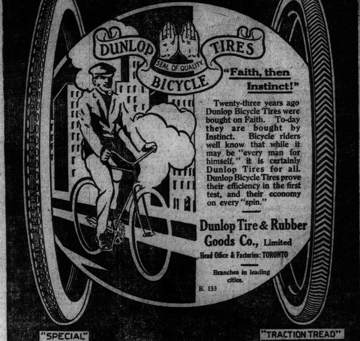
"SPECIAL" "TRACTION TREAD"

Twenty-three years ago Dunlop Bicycle Tires were bought on Faith. To-day they are bought by Instinct. Bicycle riders well know that while it may be "every man for himself," it is certainly Dunlop Tires for all. Dunlop Bicycle Tires prove their efficiency in the first test, and their economy on every "spin."