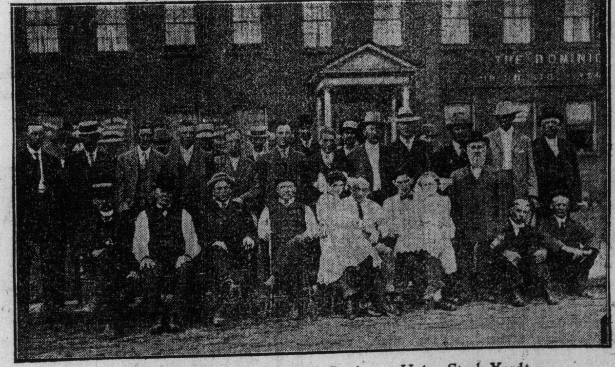
Group of Well-Known Live Stock Dealers at Union Stock Yards.

World's Estimates. Broomhall estimates wheat and flour shipments for the week, exclusive of North America at 8,000,000 bushels, against 7,240,000 last week. Of this Europe will take about 6,800,000 bushels. Total shipments last week 10,488,000 bushels, and last year 10,464,000 bushels. Arrivals of breadstuffs into the United Kingdom will agregate about 5,600,000 bushels. He predicts that there will be moderate changes in the quantity of breadstuffs on passage.