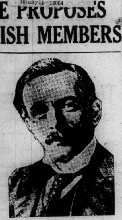
RT. HON. DAVID LLOYD-GEORGE.