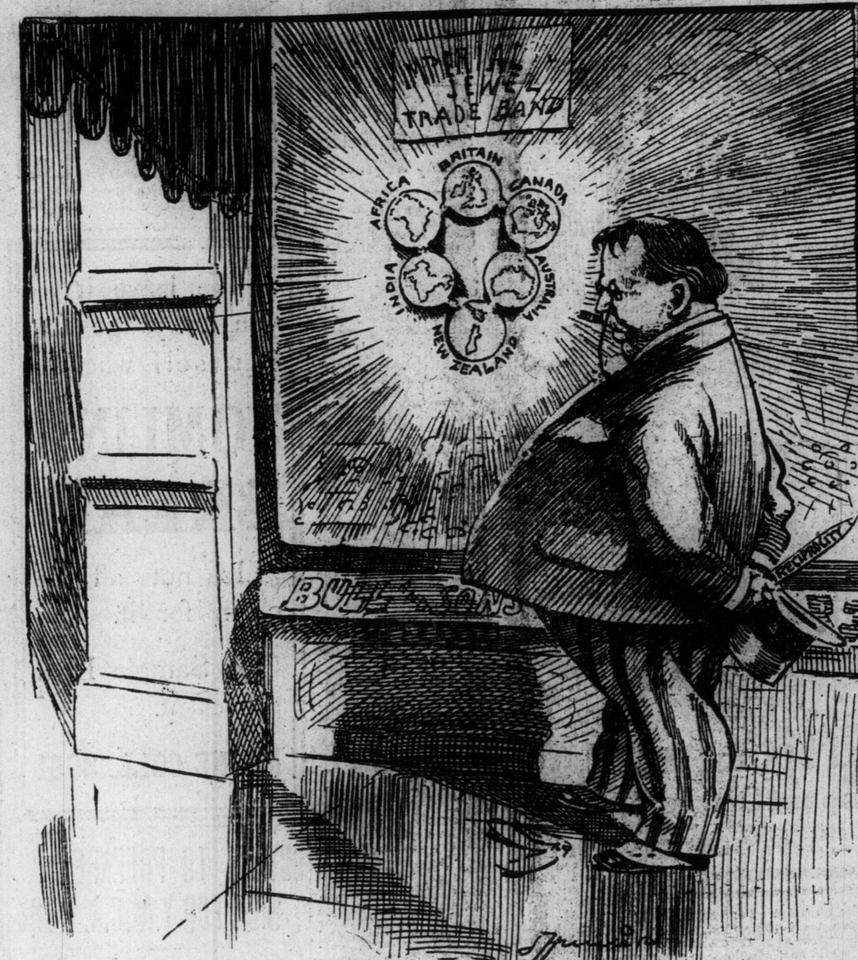
MR. TAFT: I'd like to cut the band and grab that Canada gem.