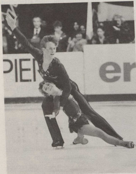
Gold medal winners Paul Martini and Barbara Underhill.

In a dazzling performance that erased all memories of a disappointing seventh place in the Sarajevo Winter Olympics, Canada's skating pairs team of Barbara Underhill of Oshawa and Paul Martini of Woodbridge, Ontario won a gold medal at the world figure skating championships, held recently in Ottawa. It was a crowning achievement of a troublesome career and a farewell to their amateur skating career as well.