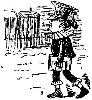
No. 3.—In due time was sent to U.C. College.