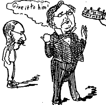
No. 11.—Declined the honour of knighthood.