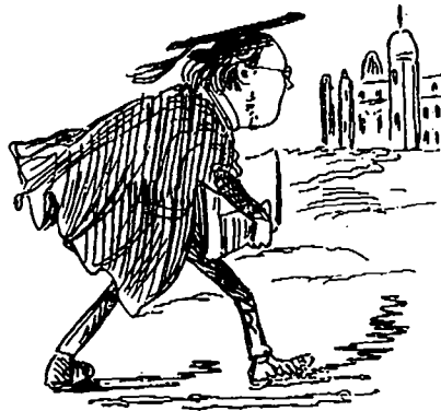
No. 5.—And passed on to the University.