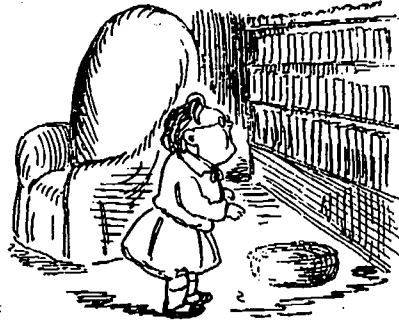
No. 2.—He was a very studious youth.