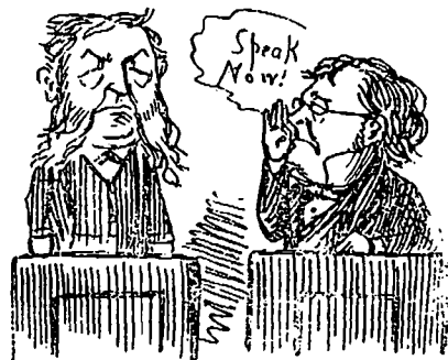
No. 8.—He entered Parliamentary life.