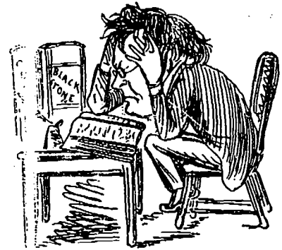
No. 6.—Afterwards becoming a law student.