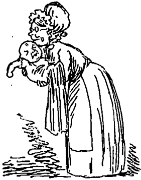
No. 1.—He was born young.