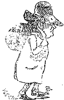
No. 9.—But still remained a great lawyer.