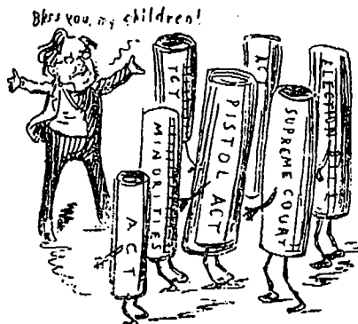
No. 10.—He introduced many good measures.