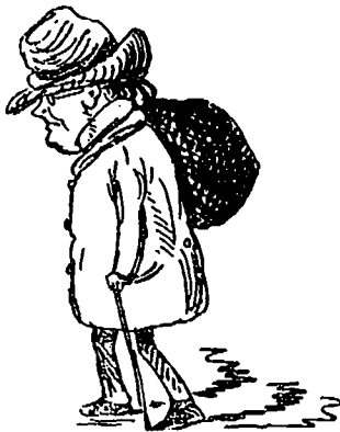
No. 7.—He ultimately became a leading lawyer.