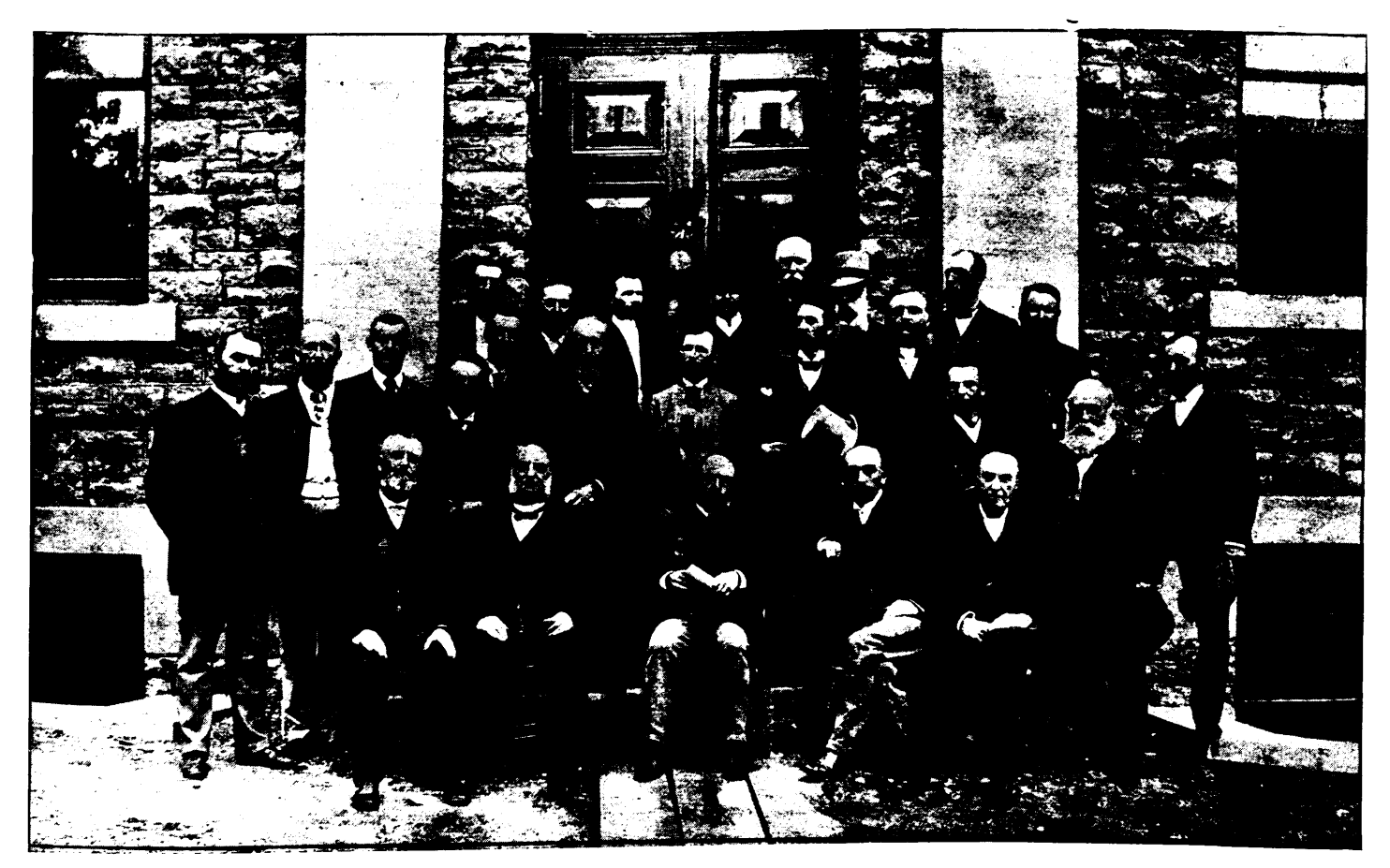
CONVENTION OF THE EXECUTIVE HEALTH OFFICERS OF ONTARIO, AT BROCKVILLE.