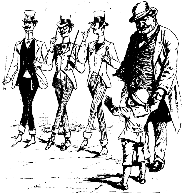
HE WANTS TO BE A DUDE.

For further information apply to any Canadian Pacific Railway Ticket Agent.