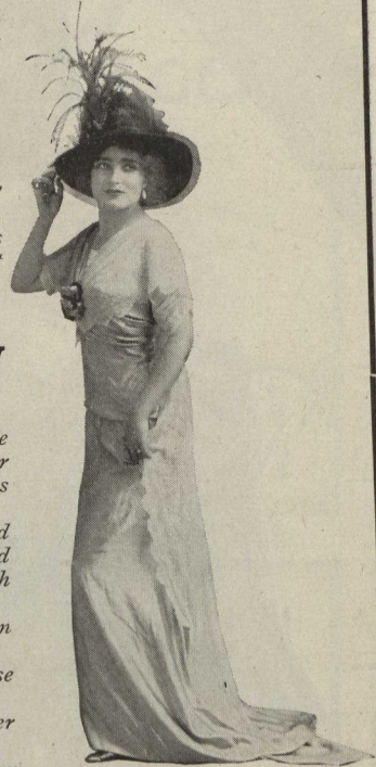
White Crepe Meteor dyed yellow

"Dyeing it a striking pale yellow, with Diamond Dyes and trimming it with shadow lace, it made an unusually charming stylish dress"