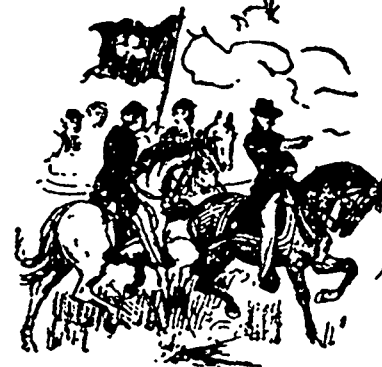
Gen. Hancock and Staff.

The greatest and grandest Cyclorama in the world.