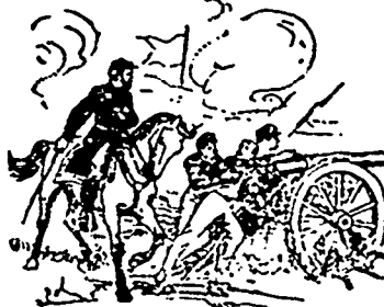
Death of Cushing.

Museum of Wax Figures, Chamber of Horror, etc. Admission, 10c.