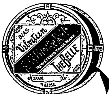
S. H. & M. BELLE Plain Velveteen 1 1/2 inch wide.