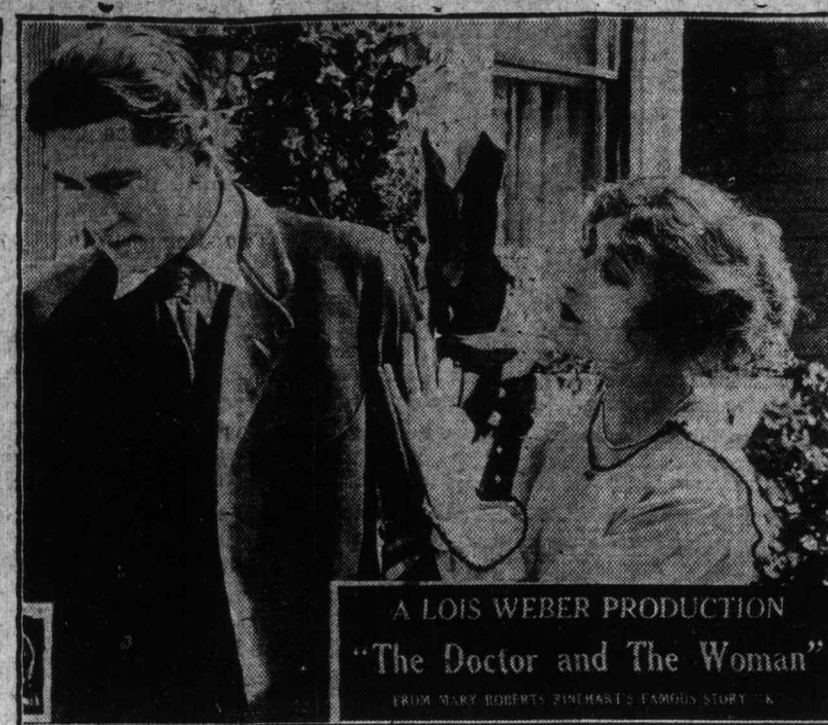
Scene from Millred Harris Mrs. Charlie Chaplin in The Doctor and the Woman at the Hippodrome Wednesday and Thursday.

New Royal Hat Cleaning Co. Ladies' and Gents' Straw and Panama Hats—Cleaning, Bleaching, Dyeing and Re blocking. Latest Styles. 61 James St., St. Catharines