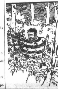
He Was Free at Last.

"Dear Ben," it ran. "I hid this and brought it here thinking you would come here. Come to the cabin on Monday night at nine. Lovingly, Mollie." The full moon gave almost as much light as the sun. The fugitive crawled down the slope and approached the