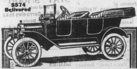
5 Passenger, Ford Touring, 1916