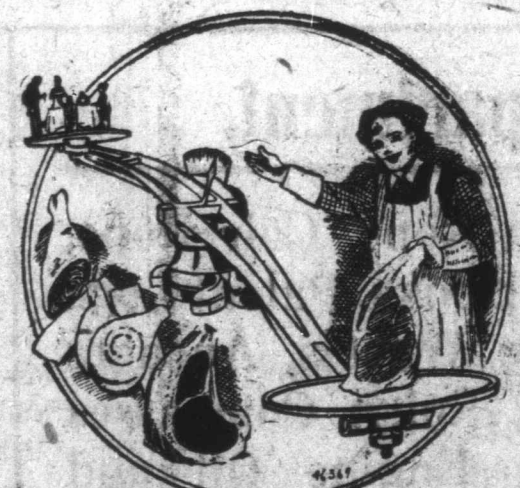
THE HEIGHT OF SATISFACTION