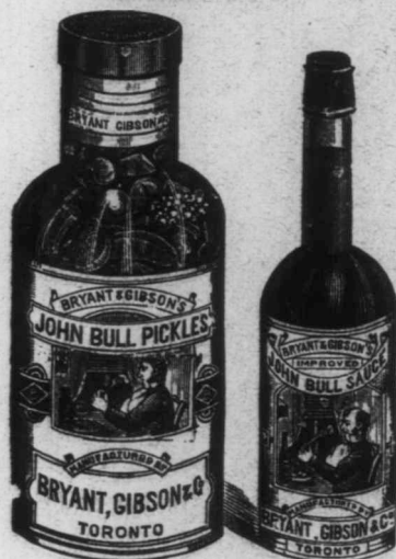
This is a facsimile of our bottles.

"Worcestershire Sauce," "Yorkshire Sauce" "Devonshire Relish" Raspberry Vinegar, Eva- porated Vegetables, Chocolates, Cocoas, Confectionery.