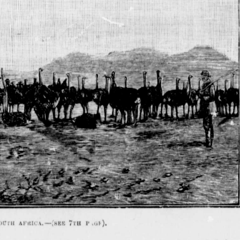
OSTRICH FARMING IN SOUTH AFRICA. - (SEE 7TH P.GF).

in future and that of the past restrained from dozen obnoxious courtiers or A despatchfrom person until British troops had surrounded