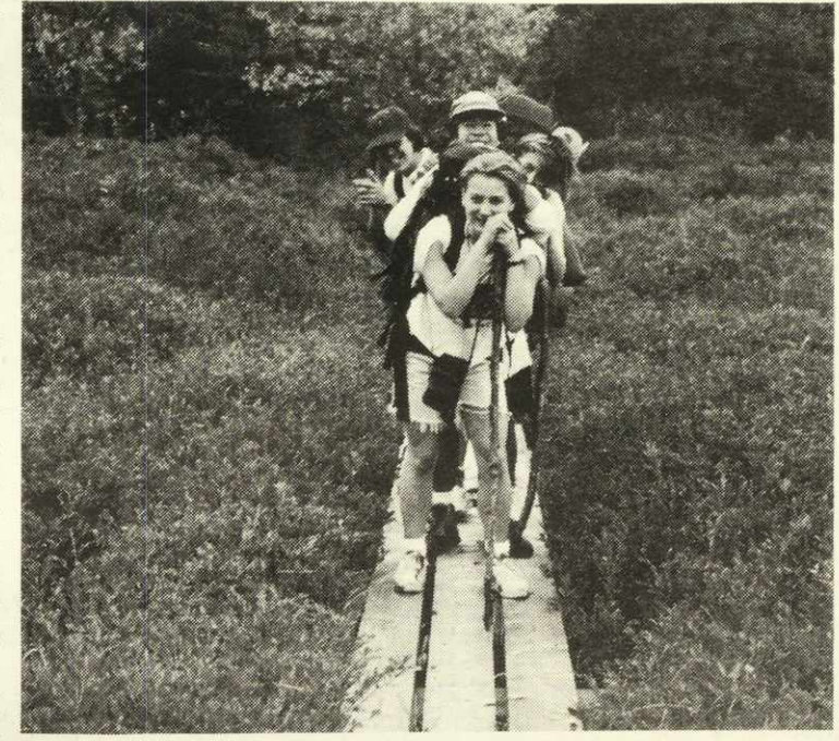
Can anyone direct us to the outdoors, please?

The Club's goal however, is not just to organise different activities for its members, but also to help subsidize the cost of these activities through fundraising events and potential sponsorship such as from the Dalhousie Student Union and Dalplex. The club's executive committee is also involved in the promotion of environmental preservation by cooperating with the Campus Environmental Action Group, the Canadian Hostelling Association and the Youth Leadership Council.