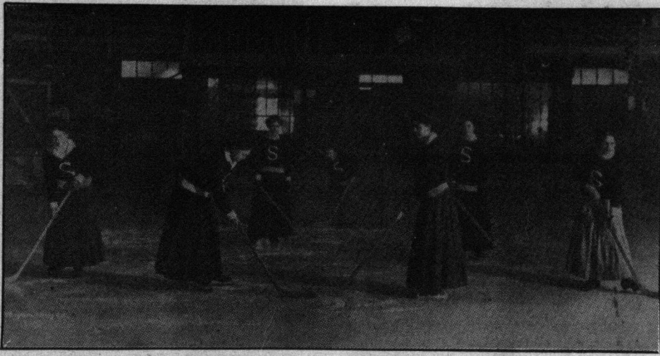
This is not Wayne Gretzky. It is the Strathcona Women's hockey team, circa 1909.