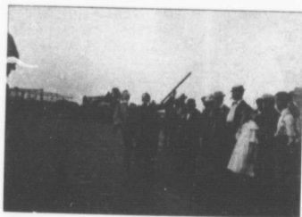
Two of the party doing the "Cake-Walk" on the pier at Brockville.