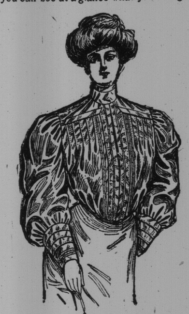
WOMEN'S WA'ST of good quality taffeta