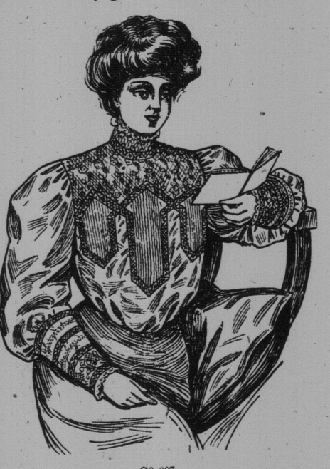
WOMEN'S JAP SILK WAIST, superior quality, back opening, yoke, collar, and cuffs daintily made of fine Oriental lace, front made of clusters of pn tucks finished with rows of Valenciennes inser-$6.00