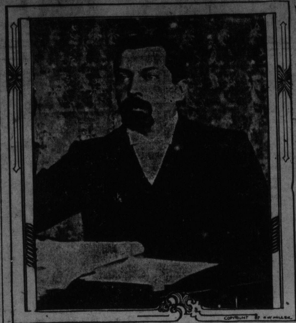
JOSE VICENTE CONCHA

Price, 50 cents per box, or 3 boxes for $1.25, at all dealers, or mailed direct on receipt of price by The T. Milburn Co., Limited, Toronto, Ont.