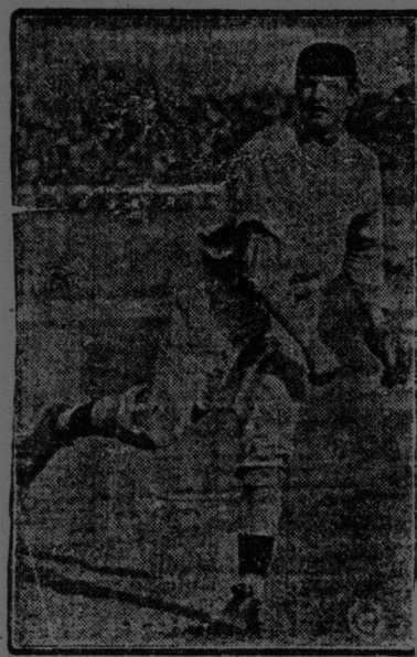
(Copyright, 1913, by The Wheeler Syndicate, Inc.)

BY CHRISTY MATHEWSON THE GIANTS' STAR PITCHER