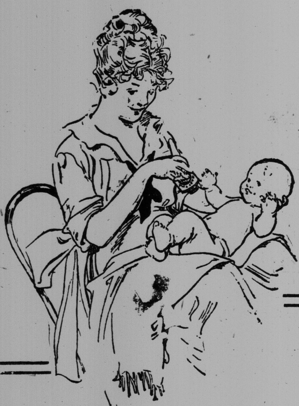
"A Babe in the House"