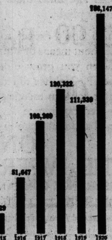
Chevrolet Sales Record

Production results will be announced not later than August 10th, 1921. Certificates will be subject to payment according to their terms, thereafter, up to September 15th, 1921.