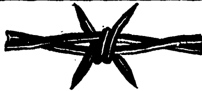
MANITOBA 4-POINT LOCK