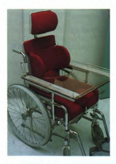
Parts, kits and complete seating units are designed to accommodate most positioning problems.

Adaptive seating systems, parts and kits for wheelchairs • Pivoting toilet seat for the physically disabled