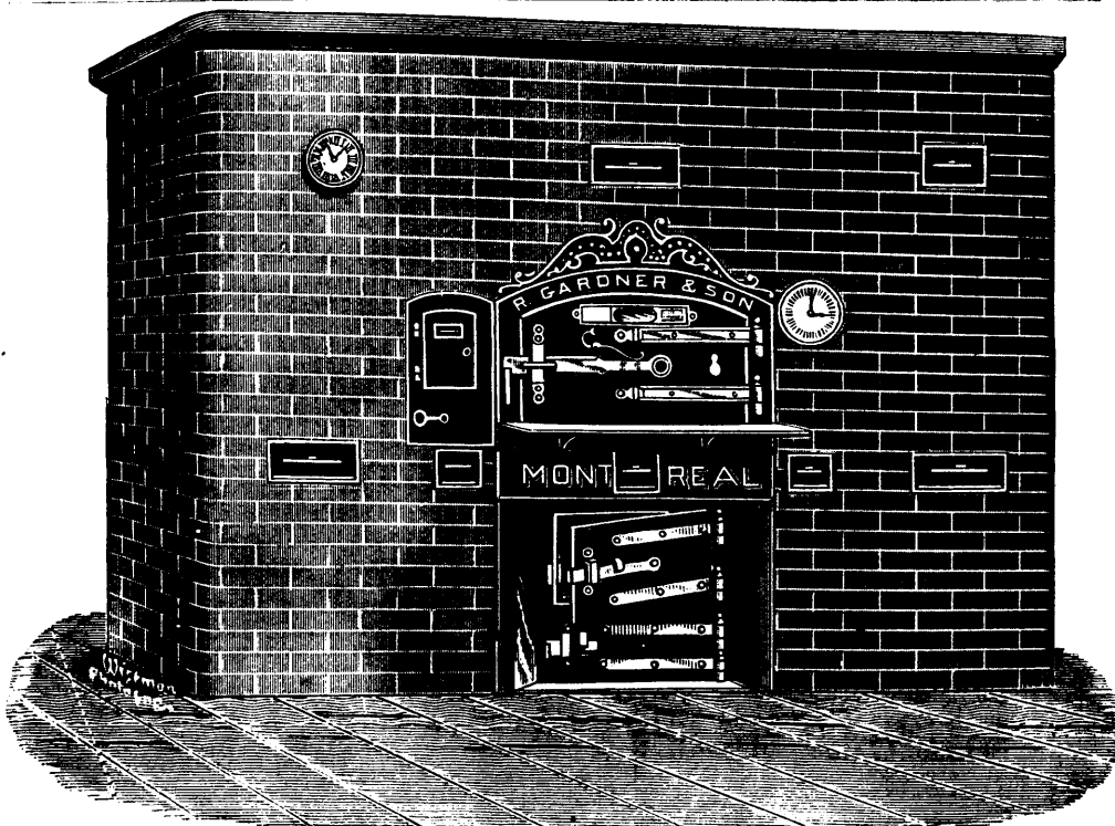
The Patent Improved Continuous Oven.

Nazareth, & Brennan, & Dalhousie Streets, MONTREAL.