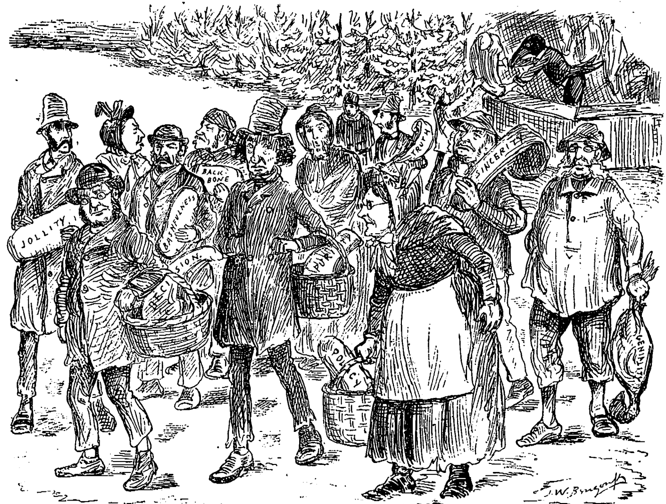
CHRISTMAS DISTRIBUTION TO THE NEEDY.

VOLUME XXI. | No. 27. | TORONTO, SATURDAY, DEC. 29, 1883. | $2 PER ANNUM. 5 CENTS EACH.