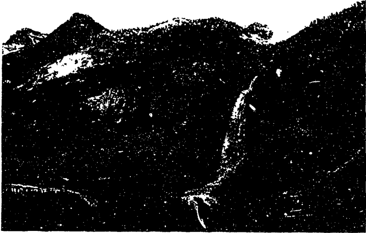
TAKAKKOW FALLS AND YOHO VALLEY, B.C.