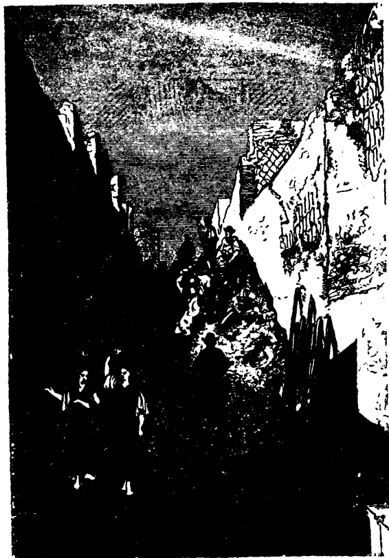
FIG. 1. CLEARING THE GROUND.