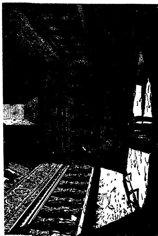
FIG. 4. TEPIDARIUM OF PUBLIC BATH.