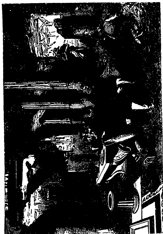
FIG. 2. SEARCHING FOR RELICS.