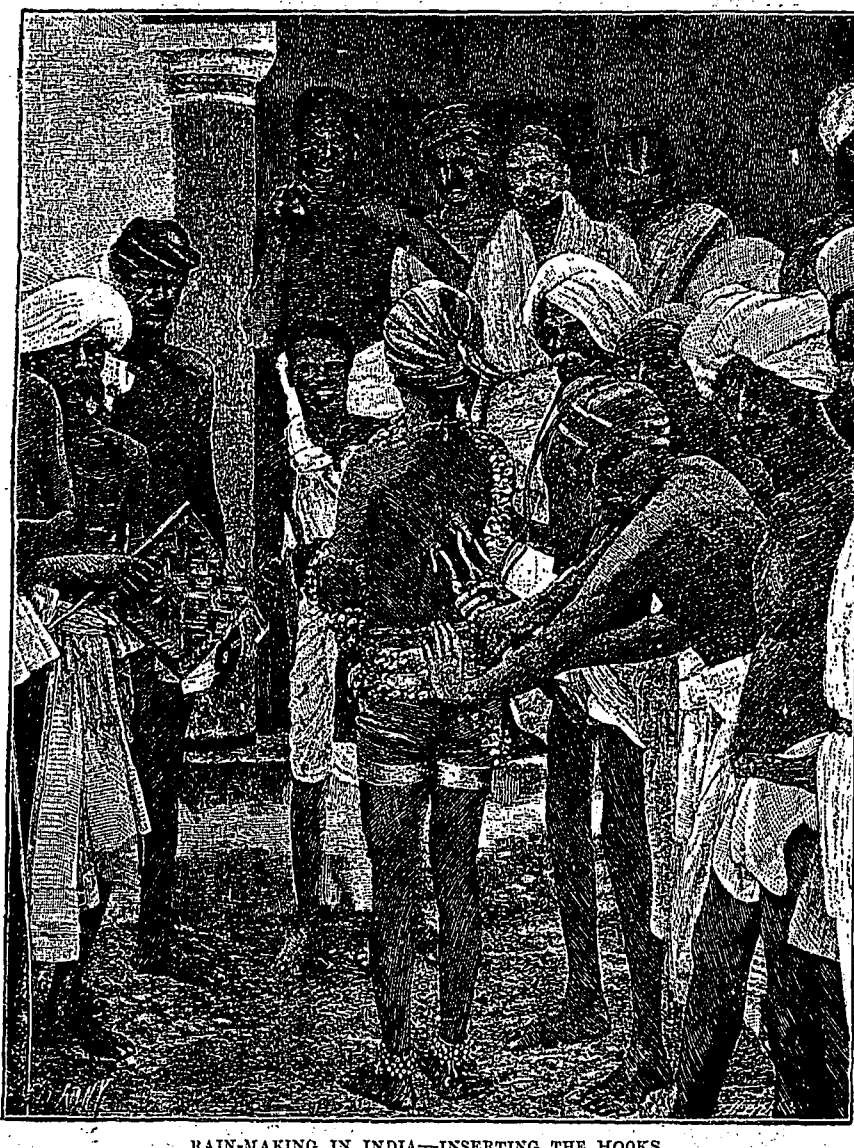
RAIN-MAKING IN INDIA-INSERTING THE HOOKS.